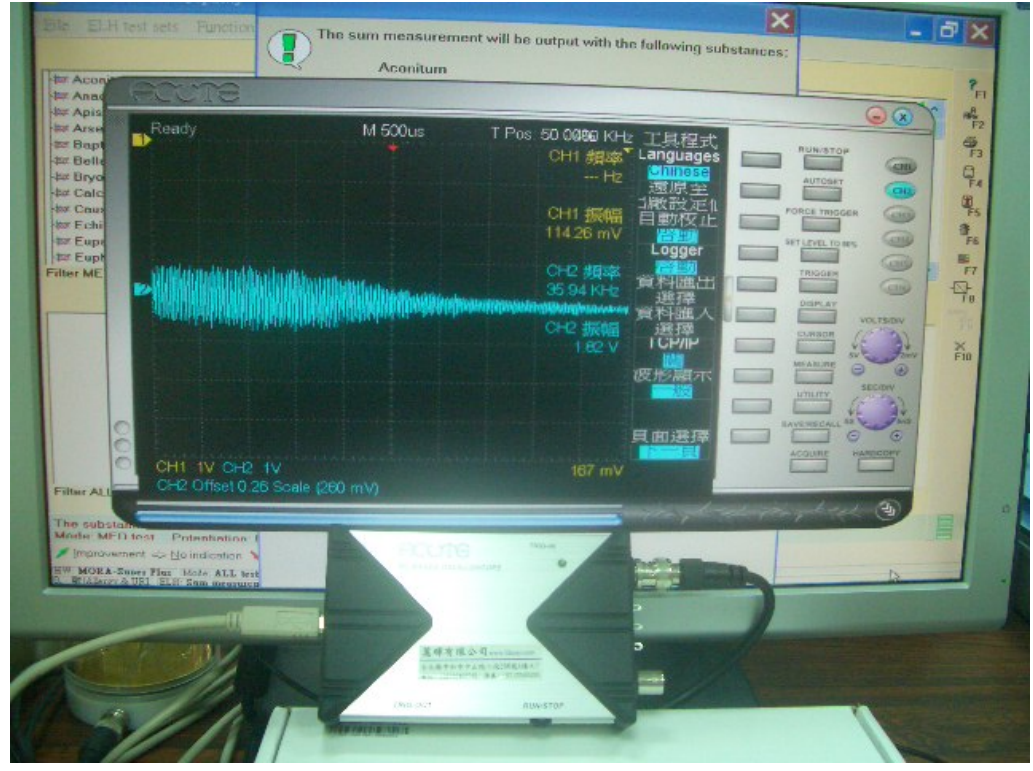
Figure 1. The electromagnetic waves of the selective electronic copies of allergens and electronic-homoeopathic copies of remedies (EHCs) of MORA Super+ device,

(The probability of effectiveness : > > )